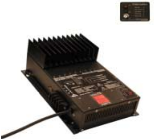
(Shown with Optional Digital Meter)